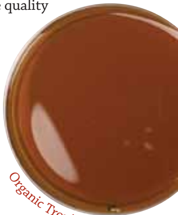
Organic Tropical Blossom