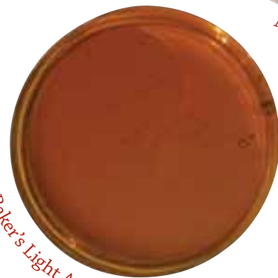
Baker's Light Amber