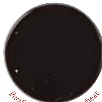
Pacific Northwest Buckwheat