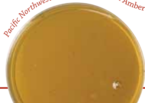
Pacific Northwest Blackberry