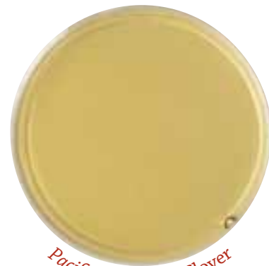
Pacific Northwest Clover