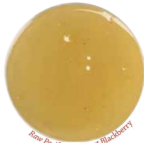
Raw Pacific Northwest Blackberry

At GloryBee, honey has always been our heart. From our founder's first beehives, to our status today as one of the Pacific Northwest's largest honey suppliers, we have always taken great pride in the quality and flavor of our honey. We work closely with beekeepers, large and small, to bring you the best and most flavorful honeys available. Among our treasured collection you will find many unique, raw, organic, and specialty varieties of GloryBee Honey you won't find in the grocery store.