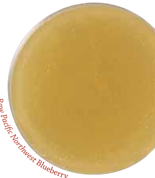
Raw Pacific Northwest Blueberry